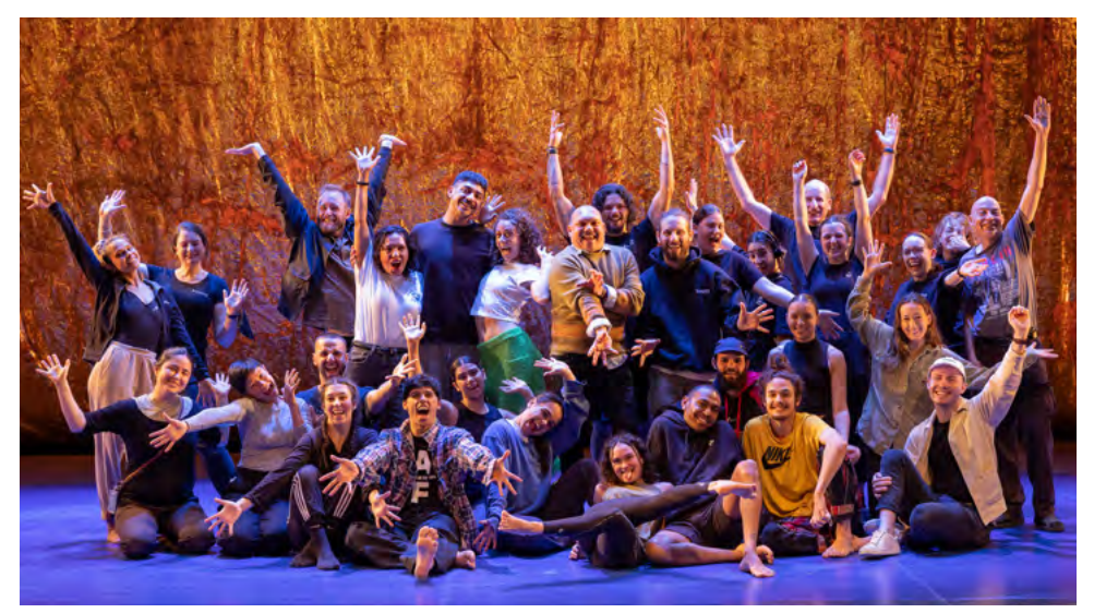
SandSong Sydney Closing Night