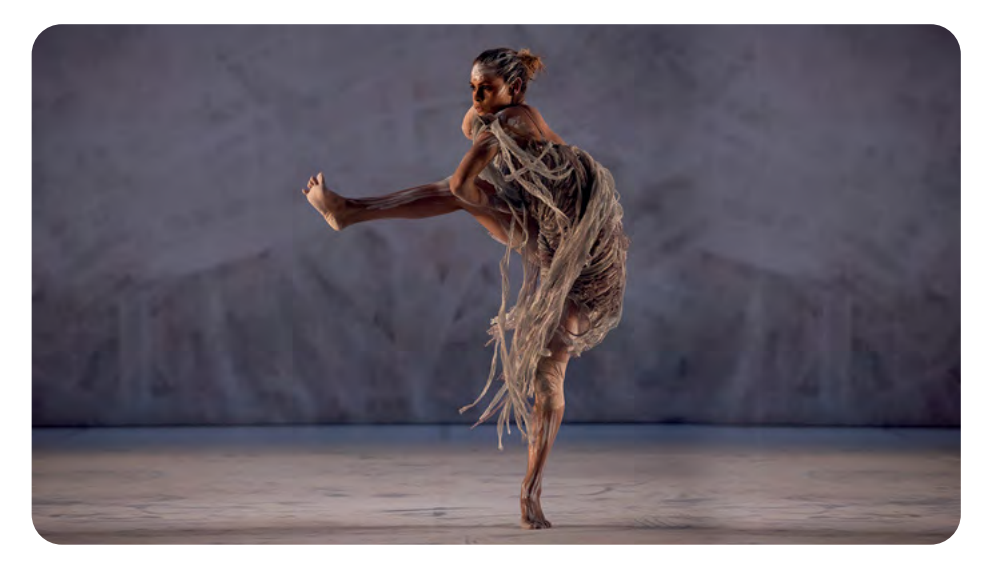
Citi is proud to support Bangarra's mission to create inspiring Aboriginal & Torres Strait Islander experiences that promote awareness and understanding of our cultures.