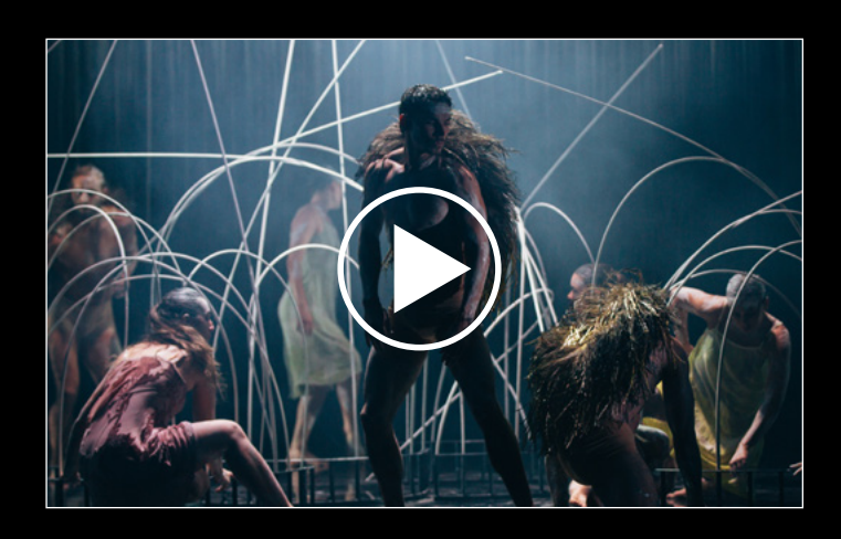
CLICK TO VIEW THE TRAILER CLICK TO VIEW FULL PRODUCTION