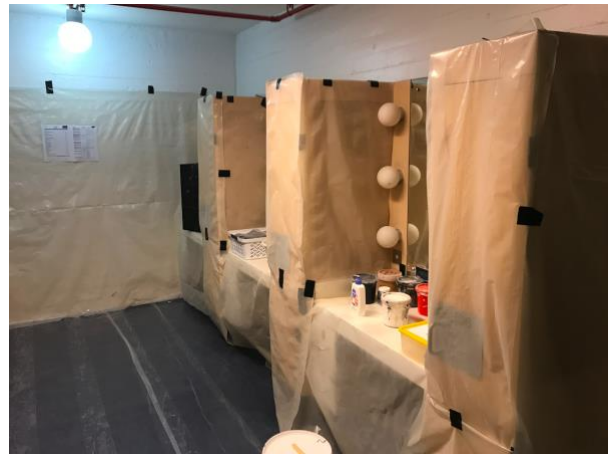
Typical Paint up room (note: plastic on floor, walls and benches)