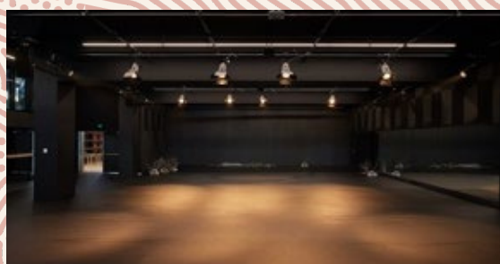
Studio 1 an additional 80 seats can be hired, bringing the total seated capacity to 200

A large light filled foyer is shared by all of the above spaces. The Foyer can be hired in conjunction with the Function Space, if outside business hours, by negotiation.